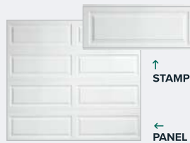
LONG RANCH PANEL