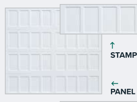
SHORT RECESSED PANEL