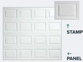
TRADITIONAL RAISED PANEL