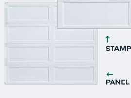
LONG RECESSED PANEL