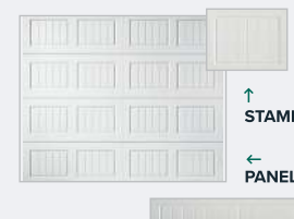
SHORT VGROOVE PANEL